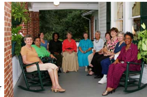
PEARLS of Hampton County Advisory Board Members